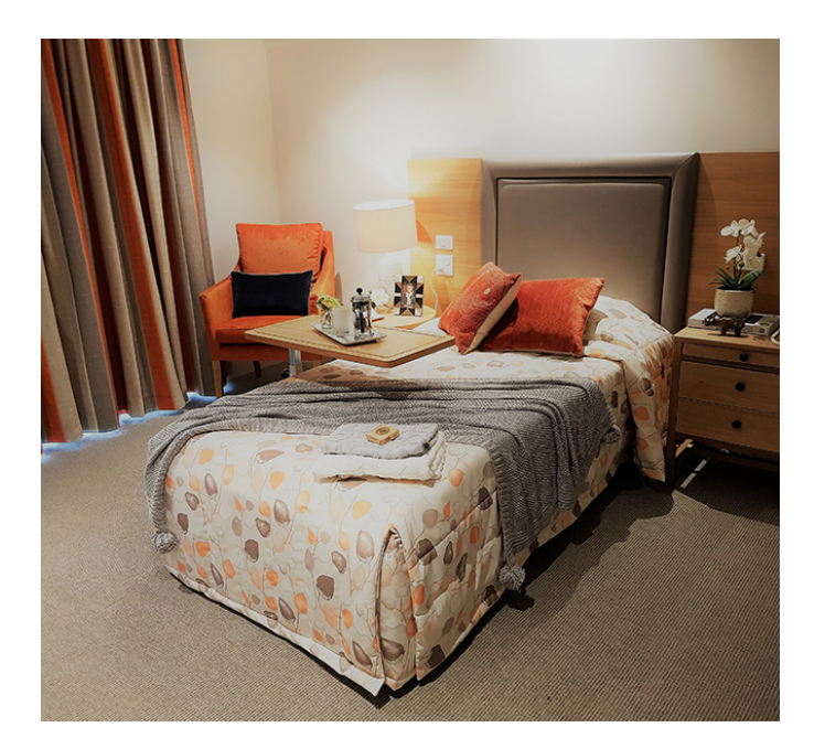
Extra Large Single Room Cost $550,000