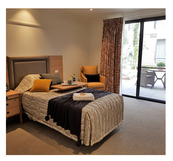
Large Single Room Cost $456,000