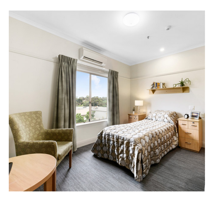
New Single - Private Room Cost $415,000