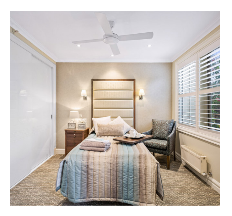
Single Room - Private Room Cost $550,000