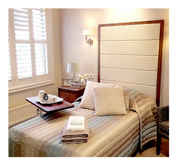
Medium Single Room Cost