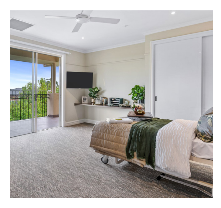
Large Single Views Room Cost $1,035,000