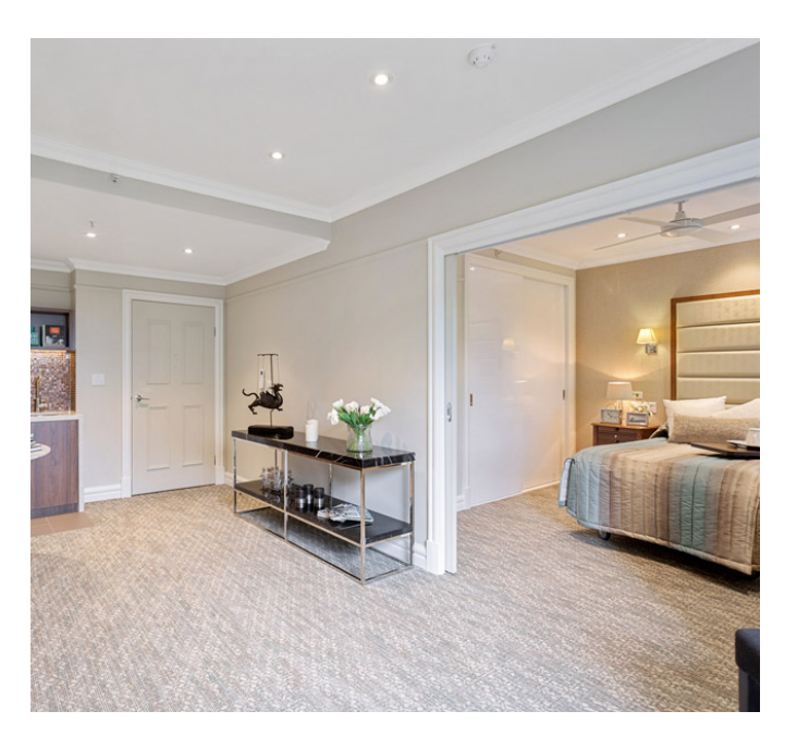
Apartment Room Cost