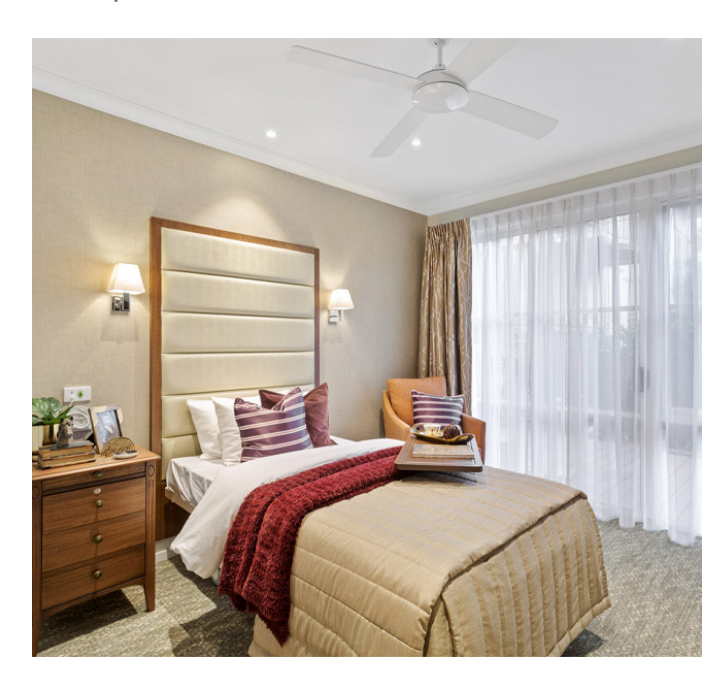
Large Single - Balcony Room Cost $710,000