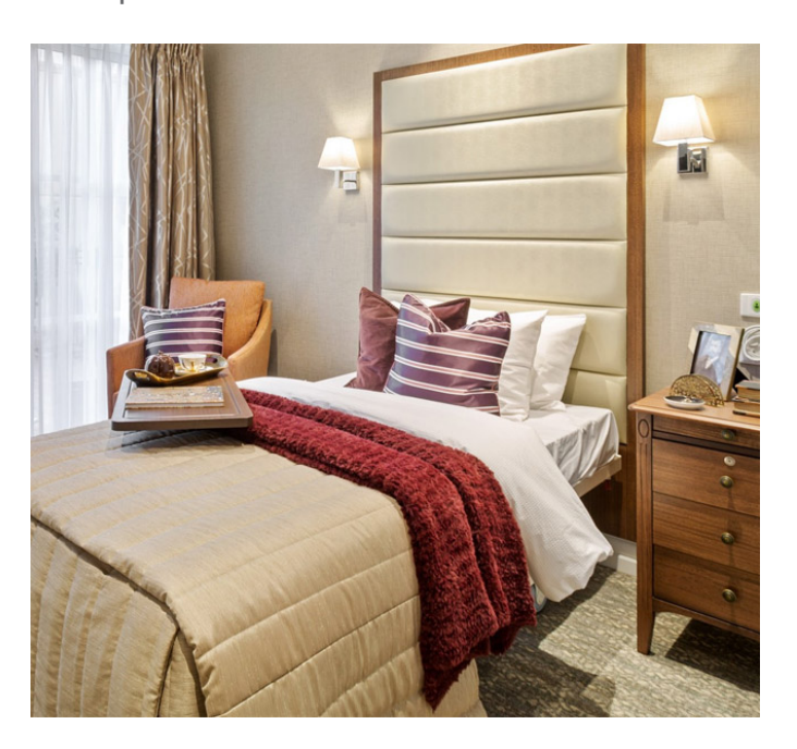
Extra Large Single Room Cost $750,000